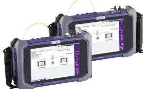
Three-slot handheld modular test platform for fiber, wireless and transports applications