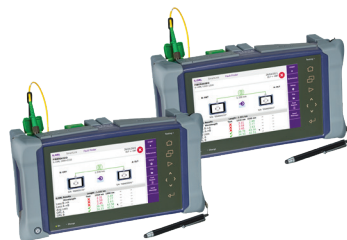
Two-slot handheld modular test platform for fiber applications